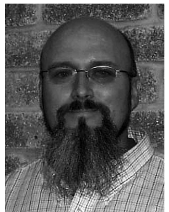
BY CLINT SHEEHAN

"The theology of the Old Testament can be organized around the central concept of kingdom through covenant. God is establishing His kingdom through the medium of His covenant relationship with men and women."